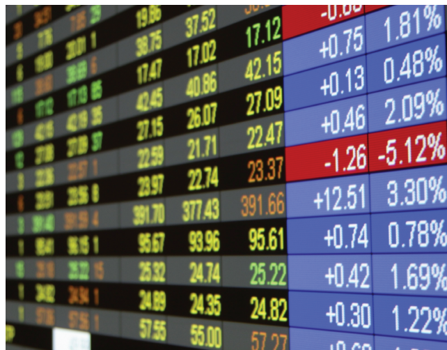
Real-time quotes at the stock exchange.

underlie less volatile periods still govern credit risk. The study revealed that credit risk follows slowly decaying functional form, implying that dangerous credit positions are more likely than is commonly believed. According to the authors, the credit rating approach may help improve the estimation of credit risk, particularly in the event that financial services companies respond slowly to changes in corporate credit quality, as recent surveys report. — J.V.